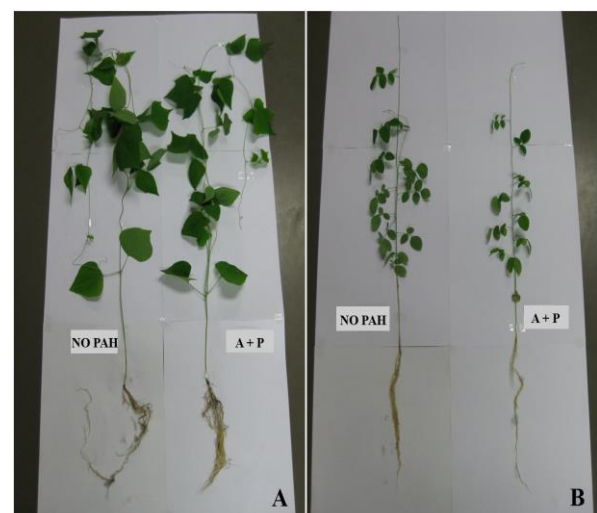
Figure 1. Comparative growth of yam bean (A) and butterfly pea (B) on day 75 of experiment. Abbreviations; A = anthracene, P = pyrene and NO PAH = non-contaminated soil.

Butterfly pea and yam bean grew well in both anthracene + pyrene-contaminated soil and in non-contaminated soil, based on plant growth parameters such as shoot growth, root growth, leaf morphology (Figure 1) and chlorophyll content in leaves (Table 1). However, nodule formation was adversely affected by the presence of anthracene and pyrene in soil, as noted from the decrease in the number of nodules formed in butterfly pea. Butterfly pea did not produce any nodules on day 30. On day 75, two nodules per plant and 5.5 nodules per plant were observed in butterfly pea grown in anthracene + pyrene-contaminated and in non-contaminated soil, respectively. Unexpectedly, nodules were not found in yam bean plant grown in either anthracene + pyrene-contaminated or non-contaminated soil, on days 30 and 75. Nodules are expected to form in the yam bean roots (Castellanos et al. , 1997). The reason for their absence in the roots of yam bean grown in this experiment is unknown. Storage root was formed in yam bean grown in non-contaminated soil, but not in soil contaminated with anthracene and pyrene (Figure 2). To our knowledge, storage root is not known to occur in butterfly pea in nature.