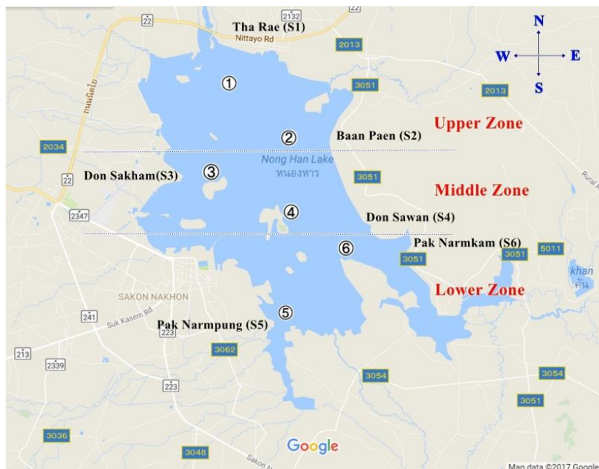
Figure 1. Map and location of the 6 sampling stations in the Nong Han wetland, Sakon Nakhon Province, Thailand.

Samples in the Nong Han wetland were randomized and collected between November 2016 and June 2017. The samplings were divided into 3 seasons, according to Thailand Meteorological Department (2016). Seasons are defined as winter season, which is during the middle of October to the middle of February when the water storage level is at the highest and starts to decline, the water temperature is low, and the water is clear due to sedimentation. The summer season is from the middle of February to the middle of May when the water storage level is at the lowest and the water temperature is at the highest. The rainy season is from the middle of May to the middle of October when rainfall is at the highest when the water storage level starts to increase and the water has high turbidity. The surveys were evaluated in November 2016 (winter), March 2017 (summer), and June 2017 (rainy).