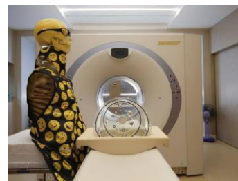
Figure 2. Experimental setup