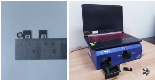
Figure 3. “nanoDot™” dosimeters and a mobile reader “microStar”

The OSL calibration was performed by Thailand Institute of Nuclear Technology (TINT) using cylindrical and slab phantoms in terms of Hp(3) and Hp(0.07), respectively. The nanoDot™ dosimeters (Landauer Inc., USA), designed for measuring a small, single point radiation exposure normally worn on a wrist or a finger, were selected in this study. Each dosimeter, 10x10 mm 2 in size and 2 mm thickness, was composed of carbon doped aluminum oxide (Al 2 O 3 :C) crystal, whose thickness and diameter were 0.3 mm and 7 mm, respectively, sealed in a thin polyester sheet. Measurements were read out by a microStar mobile reader (Landauer Inc., USA). In the luminescence process similar to the optically stimulated luminescence (OSL) or InLight dosimeters, the irradiated dosimeters were stimulated by a visible green light from the light emitting diode (LED). The amount of luminescence was proportional to the absorbed radiation and remained significantly unchanged after the reading. This characteristics enabled nanoDot™ to be read out many times. The effective dose was evaluated by a correction factor between the conversion coefficient of Hp(10) and Hp(0.07) for ICRU-slab as in the following equations: