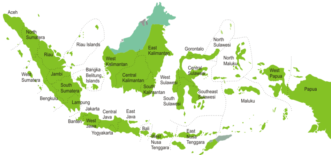
Figure 1. Map of Indonesia

vital transportation mode in this region, airport development as backbone of air transportation is a priority that must be dealt with early (Hossain & Alam, 2017; Saldiraner, 2013).