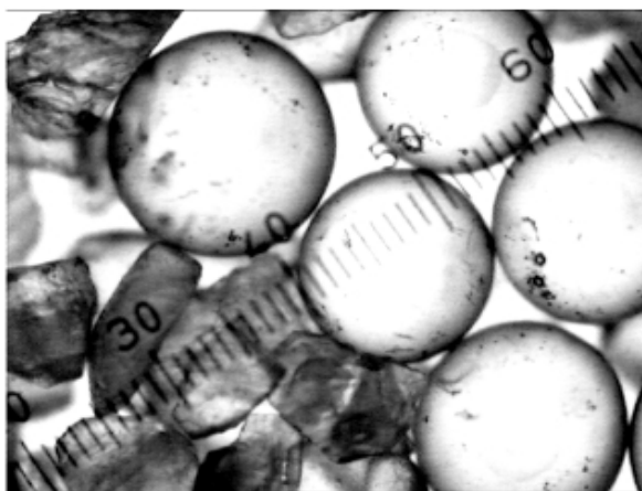
Figure 1. Photomicrographs of sands and glass beads (round-shaped). Each scale represents 25 µm.

a Determined by using a light microscope equipped with a stage micrometer. Data are average values of fifty measurements.