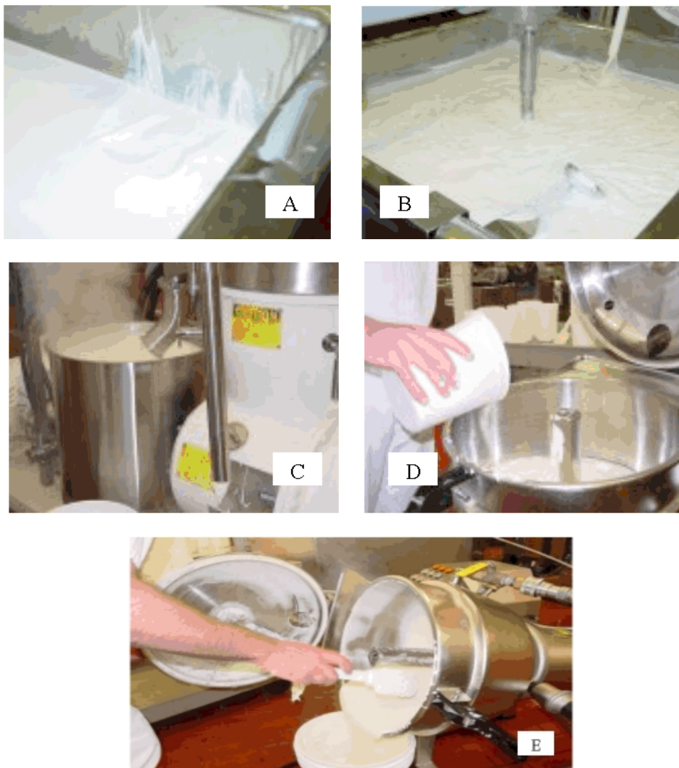
Figure 2. Cream cheese processing steps

A) Acidified milk gel at pH 4.7-4.8; B) Stirring and heating to get ready for whey separation step; C) Whey separation by centrifugal cream cheese separator; D) Mixing with salt and stabilizer and shearing; E) Hot-pack cream cheese