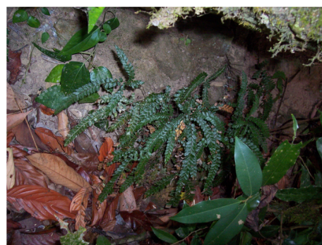
Figure 1. Adiantum hispidulum Sw. in its natural habitat near Hong Thong Falls, Phu Kradueng, Loei province.

Conservation Status. — So far, only a small population of about 20 individuals has been found. We considered